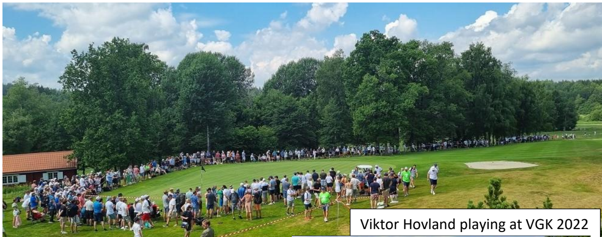
Viktor Hovland playing at VGK 2022

Mail: post@vgk.no Phone: +47 33 36 25 00