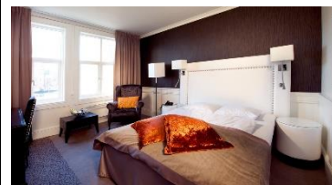
Double room double bed

NSG has reserved 60 rooms. We recommend to book early to get your preferred type of room